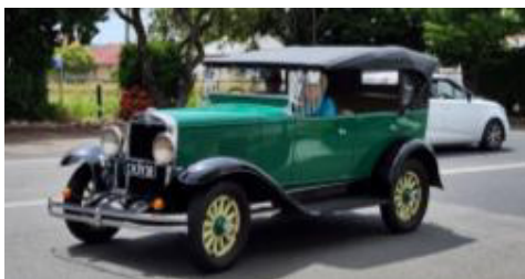
Vintage Vehicle Touring Enthusiasts

Lunch was probably a tad slow but very edible. With such great company and good food, it was just the best way to end the day. It was a successful start to what is shaping up to be a fun year for club members. Hedley